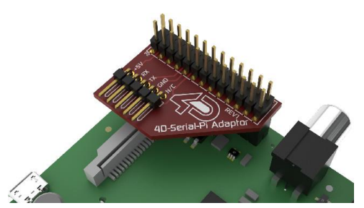
4D Pi Serial Adaptor attached to a Raspberry Pi