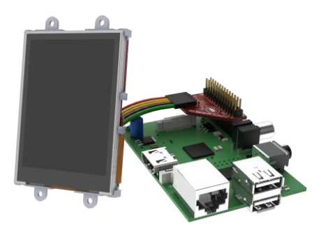
4D Pi Display Module Pack (4D Pi Serial Adaptor is one part of this pack)

NOTE (*): Raspberry Pi remains the property of the Raspberry Pi Foundation. All references to the words 'Raspberry Pi' are Trademarks of the Raspberry Pi Foundation, and all references to 4D Systems modules/adaptors with the Raspberry Pi are based on compatibility with the Raspberry Pi Hardware, and do not indicate ownership of or to the Raspberry Pi in any way.